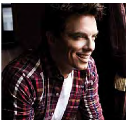
Well-Strung, a caring hubby and death threats are all part of John Barrowman's (above) life.

If the U.S. media is here (I'm indicating a high level with my hand), and the Brits are here (somewhere in the middle), then the Daily Beast is close to the bottom of the barrel. You might have heard that a straight reporter was sent to Rio to lure gay Olympians on Grindr and out them. But that wasn't the purpose of the story (which has since been deleted). The story was ostensibly about how much sex is going on in the Olympic Village—something we've heard about for years. The writer went on both gay and straight apps looking for sex and—again, not surprising—he got more responses on Grindr than all the other apps combined. That explains why the piece was titled "I Got Three Grindr Dates In An Hour In The Olympic Village." What shocked me most is that the writer used his own photo—and let's just say he's not a looker. While no athletes are named, he included clues about the guys' events, countries, and placing. Ultimately, the takeaway is that gay men are looking for more sex than straight women—surprise, surprise. If he wanted to get a real scoop, he should have used the photo of a hot female on Tinder! My point is not to defend the writer or