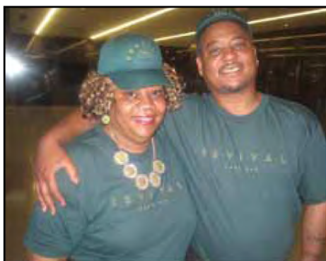
From top: The Budlong; Revival Food Hall.

—Antique Taco’s crispy fish tacos really worked, thanks in part to the fish and also because of the sriracha tartar sauce.