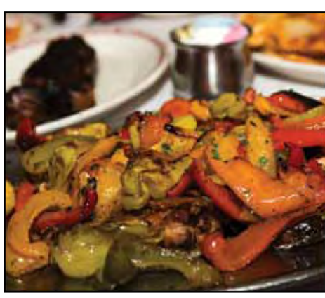
Chicken alla Joe at Gene & Georgetti.