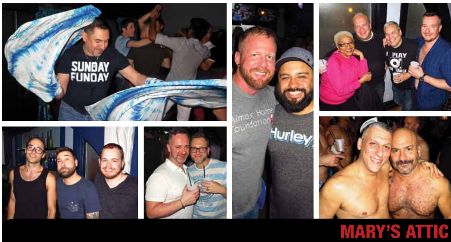
All ashore that's going ashore! Tea in A-ville takes on a nautical theme, Sunday, May 1.