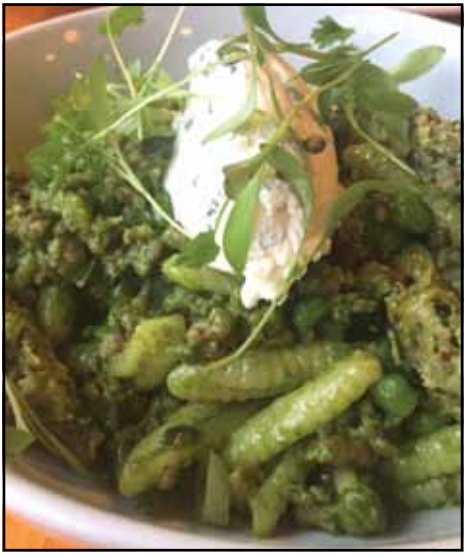
TWO.