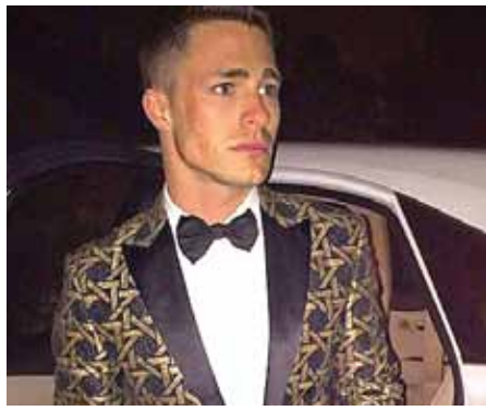
Colton Haynes made news recently.

Then there's that other "hero," Caitlyn Jenner . Reportedly, she will be appearing nude on the cover of an upcoming issue of Sports Illustrated . What is it about those Kardashians? They're constantly photographed naked at the drop of a hat—so whatever you do, DON'T drop a hat! When it comes to Caitlyn's spread, I have one simple question that I intend without malice—does anybody really wanna see all of that?