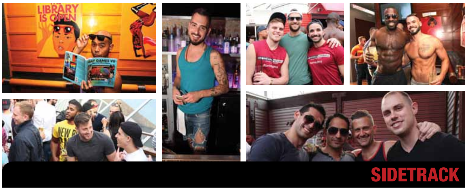
Summer's coming and Sidetrack is ready.