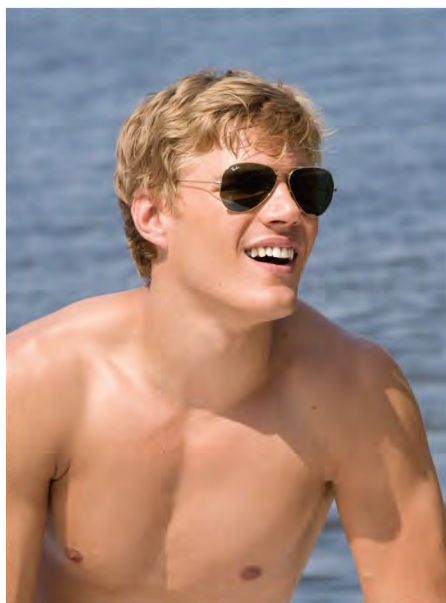
Chris Zylka is a reason some are tuning in to HBO's The Leftovers.