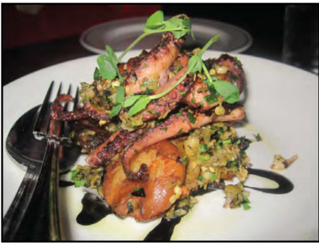
Baby octopus at The Boarding House.

However, there's much more to The Boarding House than that installation (and another one consisting of wine bottles that's on the third floor).